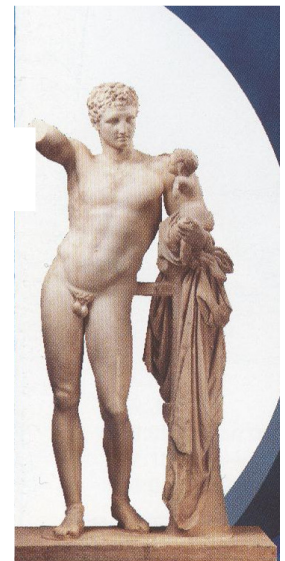
Hermès portant Dionysos, enfant de Paraxitèle